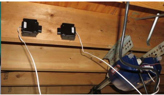
Safety electric eyes installed on joists next to opener is a Safety Hazard and just plain stupid!