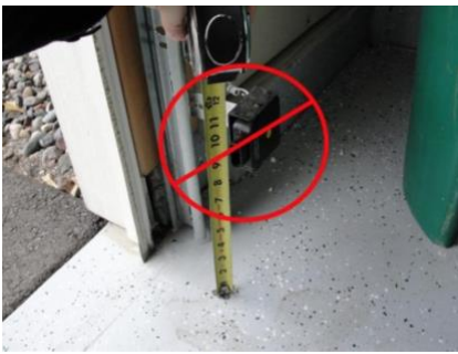
Safety electric eyes installed above 6" is a defect.

The button to control the door operation needs to be at least 5 feet above the floor or platform so a small child cannot reach.