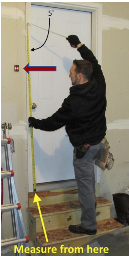
The garage door opener control button must be at least 5 feet from where one could stand, to avoid children from playing with the door. Control is at red arrow.